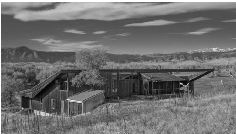
Martha Weiser House, Boulder County 2012