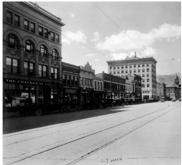
Pikes Peak Ave, Colorado Springs May 1918 CHS.X5327