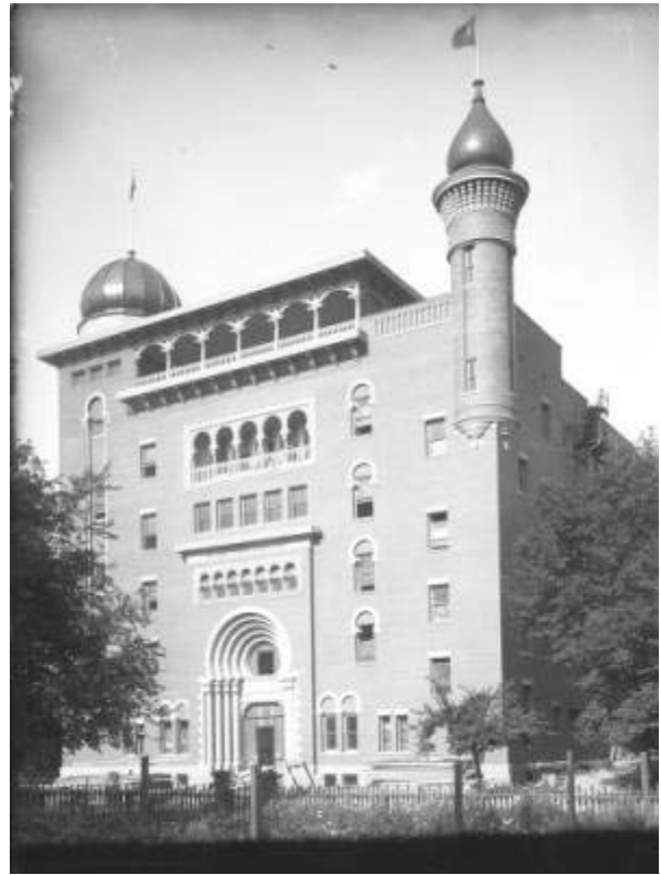
El Jebel Temple, Denver ca.1920 CHS.X7764

http://www.nps.gov/tps/how-to-preserve/briefs/35-architectural-investigation.htm